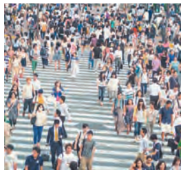
Global population growth