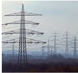
Low energy self-sufficiency rate in Japan

The Cosmo Energy Group's business (capital investment)