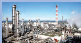
Manufacturing and sales of petrochemical products