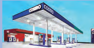
Refining and sales of petroleum products Car leasing for individuals