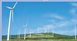
Wind power generation

Strength Relationships of trust with Middle East oil producing countries for approximately 50 years