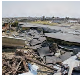
Frequent occurrence of natural disasters