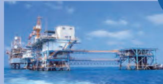
Oil development and procurement; transportation to refineries