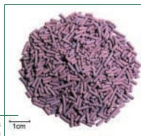
High-performance desulfurization catalysts for sulfur free diesel oil manufacturing

Enhancing performance of the catalysts required for manufacturing of petroleum products from crude oil will lead to not only a cost reduction but also an environmental pollutant reduction. We have developed direct desulfurization catalysts that are 30% more durable than existing catalysts and confirmed their predefined level of performance by verification testing conducted from November 2002 to October 2003 using the direct desulfurization unit at Chiba refinery. They are currently in trial operation at Chiba refinery's direct desulfurization unit.