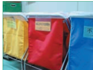
A “Clean-Corner” at the head office

We are promoting reduction of waste and recycling of resources by reducing the number of trash bins on each floor and instead instituting “Clean-Corners” where trash is separated into 20 types, including waste other than paper.